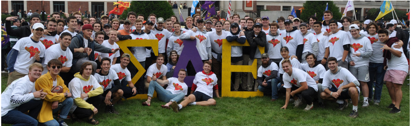
On Jump Day, October 5, 2019, Oregon Alpha welcomed 40 new members. They are listed on page 2 of this newsletter.