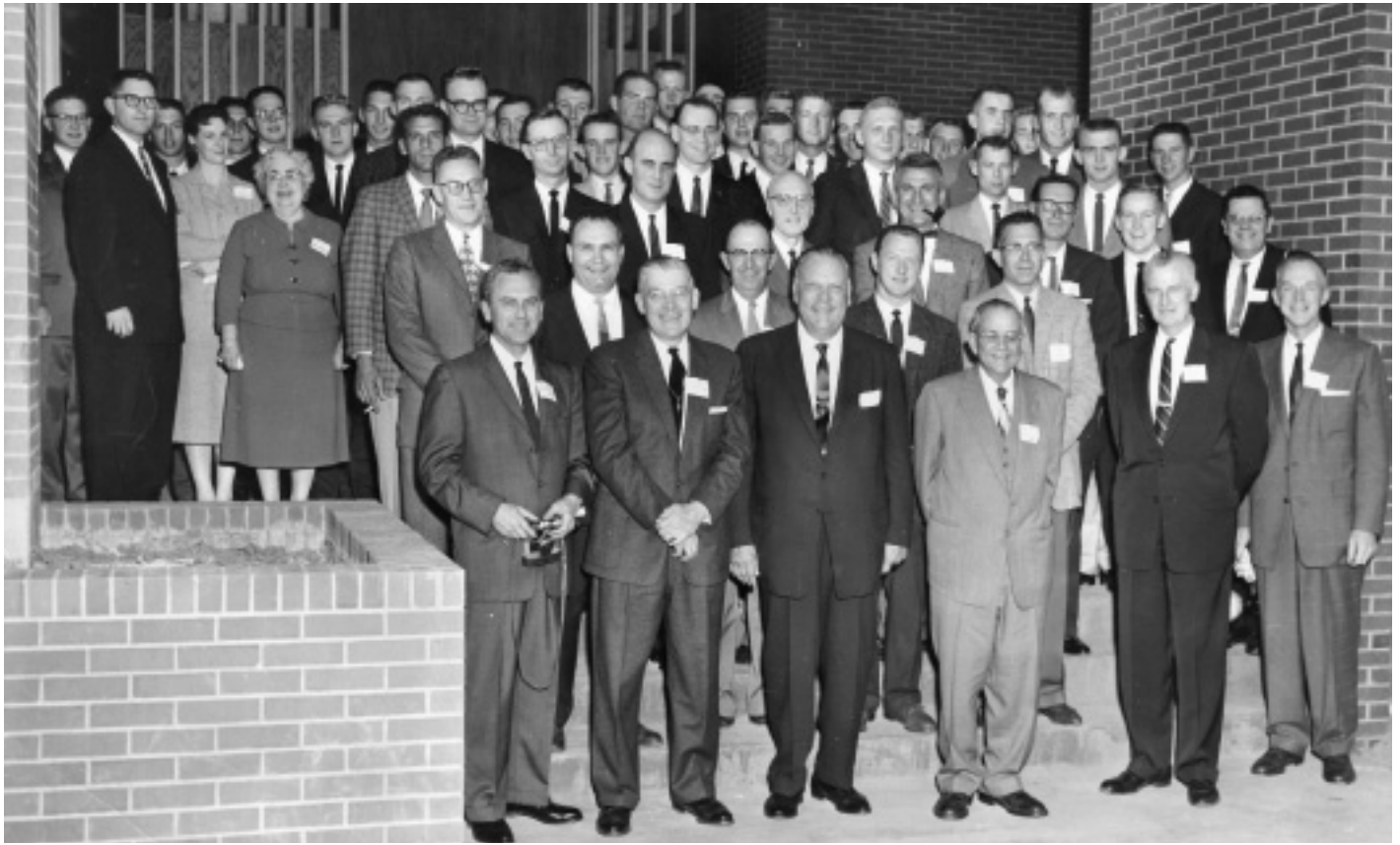
“New House” Dedication Ceremony, November 22, 1959

This fall will mark 60 years since the “new house” was opened on the same property where the Southern Colonial house stood since 1921. SAE formed a House Corporation on March 18, 1920 for the purpose of building a fraternity house on the 305x160-ft. lot “far out of town” at 29th and Harrison. This corporation has been operating successfully for nearly 100 years maintaining these two chapter houses. In June, Sigma Alpha