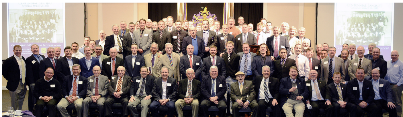
More than 160 alumni and undergraduate brothers, representing the classes of 1948 through 2018, attended Oregon Alpha's March 28 Centennial celebration.