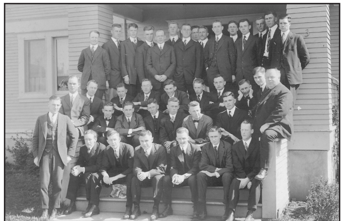
Oregon Alpha will be 100 years old on March 19, 2015. The founding class of 1915 is pictured above.

SAVE THE DATE: Oregon Alpha will celebrate 100 years as a chapter at Oregon State on Saturday night, March 28. The day will include tours of the chapter house, golf, and the Centennial Banquet at the OSU Alumni Center ballroom. More information will be provided via email and on the chapter's website ( www.saeoregonstate.com ). Plan to celebrate 100 years of Loyalty, Honor, Friendship, and Fraternity.