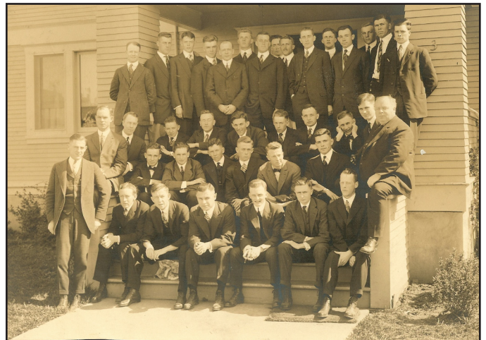
Oregon Alpha will be 100 years old on March 19, 2015. The founding class of 1915 is pictured above.