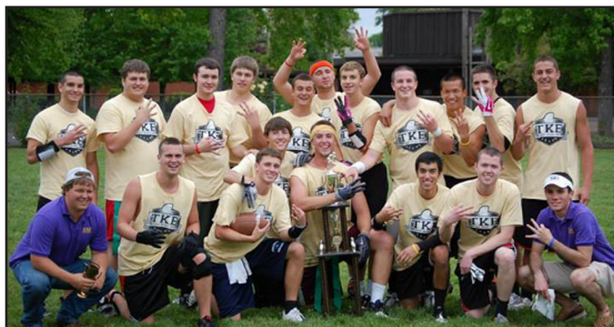
Left: Oregon Alpha wins the Pledge Bowl for the third year in a row.