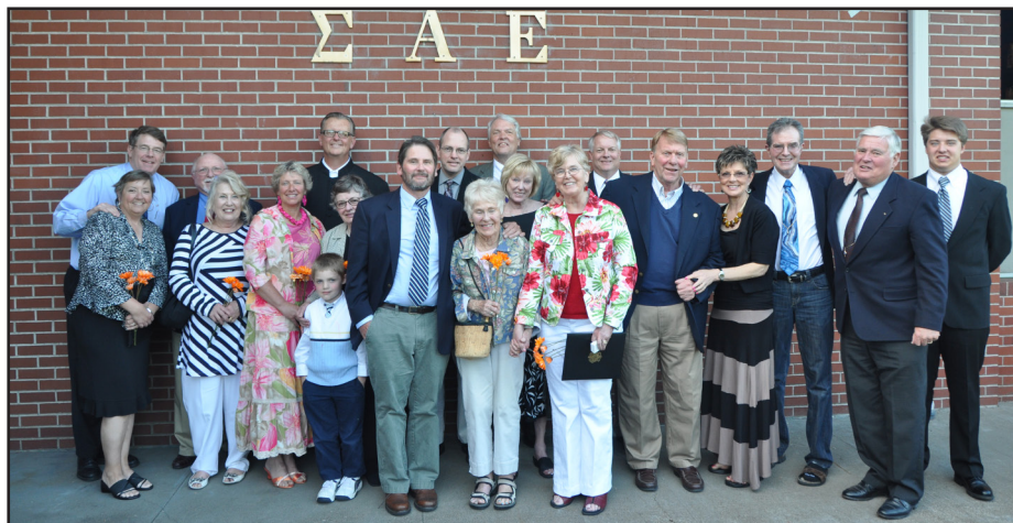
Above: Many alumni, parents, and friends attended the annual Oregon Alpha Awards Banquet.