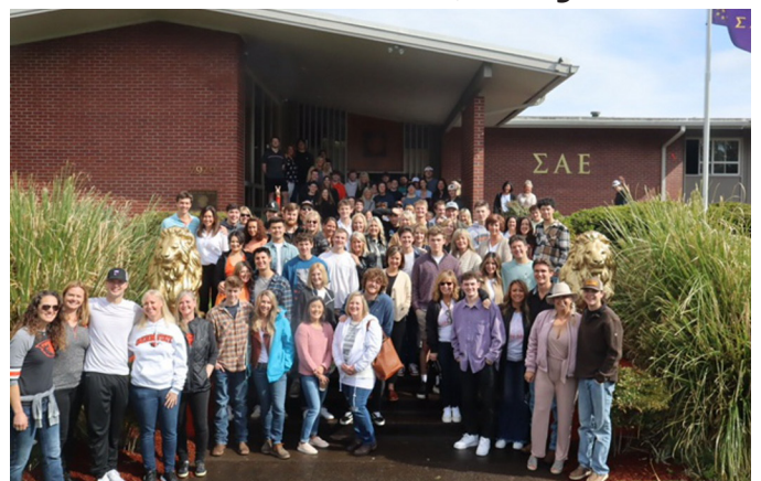
Our first since 2019! The silent auction raised more than $15,000 for the Minerva Club.